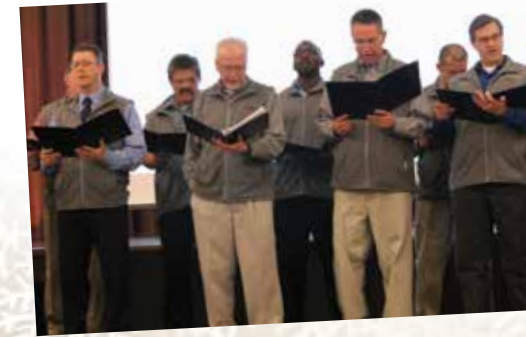
New Beginnings Choir made beautiful music at our Celebration Day.

200 families received Thanksgiving or Christmas food boxes, including all the special ingredients for a holiday feast, thanks to a cooperative program between the Mission, Walmart, Learjet and the Wichita PD.