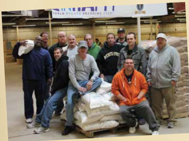
Guinness World Record! Twelve men from the Mission's New Beginnings life-change program joined other volunteers in Park City to set a Guinness World Record by packaging 479,034 hunger relief meals in one hour! The food, enough to feed 800 children for over a year, was sent to Haiti by Numana, a non-profit organization partnering with the Red Cross.