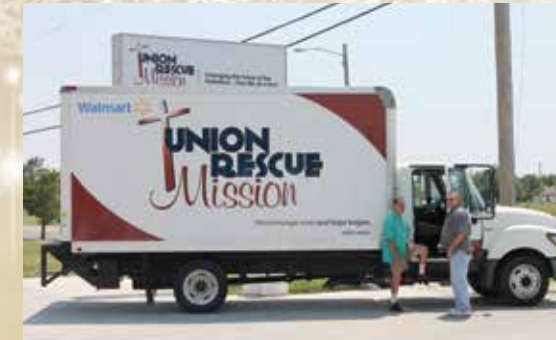
Wal-Mart donates a truck. We want to thank the Wal-Mart foundation for giving the Mission a $70,000 grant. With it, we purchased a new delivery truck that allows us to pick up food supplies for our community food pantry.