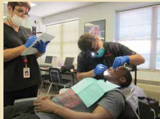
Free Dental Care. Men in our New Beginnings recovery program can now receive much-needed dental services free of charge through GraceMed Dental Clinic, a Christ-centered, non-profit community health center serving Wichita, Sedgwick County and central Kansas.