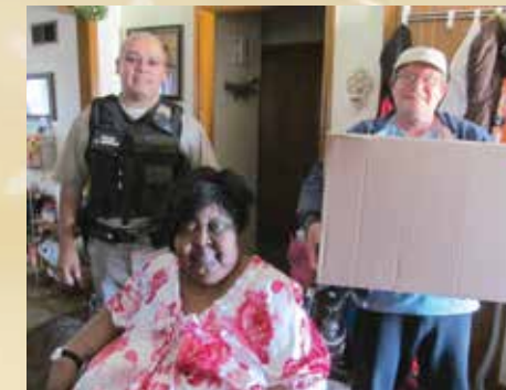
Delivering smiles for the holidays. In partnership with the Wichita Police Department, the Mission distributes more than 200 holiday food boxes to neighbors in need.