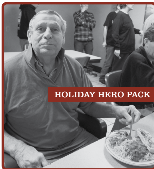
HOLIDAY HERO PACK

Shop our Gift Catalog online at urmwichita.org/GiftCatalog . Or simply add your special Christmas gift to the enclosed reply card.